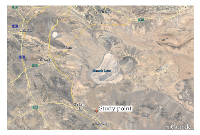
Fig. 1. Study area in the desert of Kashan in central Iran

Frictional resistance of the formed layers was measured by rubbing a sandpaper with medium roughness (100 \mu m) and compressive force of 4.9 N on their surface continuously until the layers were abraded and reached the loose soil surface. The number of times of rubbing sandpaper on the soil surface until eroding the layer was