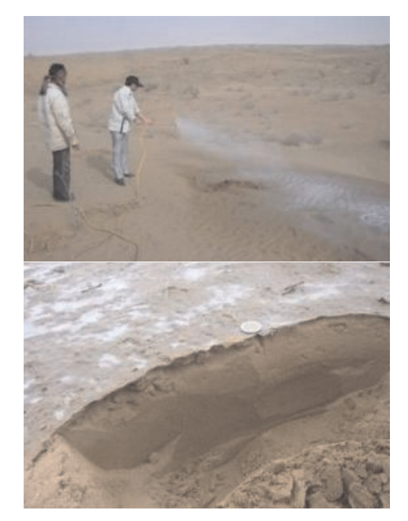
Fig. 2. Mulch spray using a tractor mounted sprayer

The project was implemented based on a split plot in the form of the basic randomized complete block design. The treatments were included in the planting procedure (including cuttings and seedlings) using the mulch solution amount 0 t/ha (control), 5 or 10 t/ha. The measured parameters were: temperature (15 cm deep), moisture (15 cm deep) using time domain reflectometry (TDR) device (model \Delta AHH2), plant survival and rate of erosion wind (by wood markers installed). The planting distance was 3 x 3 m in 7 rows (repetition) and 7 columns (the number of seedlings per repetition). For example, the number of plants (Calligonum) grown in each mulch treatment was equal to 49 bases, with totally 147 bases in different three mulch treatments. In order to create a smooth and balanced surface, all the margins of the region were covered by mulch. The test units were single sand dunes so that a 2000 m<sup>2</sup> dune was considered for each mulch treatment (6000 m<sup>2</sup> total area). The thickness of crust formed on the sand dune surface after the mulch solution treatment in amount of 10 t/ha was equal to 9 mm and after the treatment with 5 t/ha it was equal to 4 mm. Finally, data collected in the SAS environment was analyzed by ANOVA