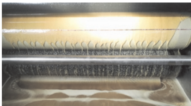
Fig. 1. View of supersaturating rollers along the line designed for coating fiberglass meshes with PF composition