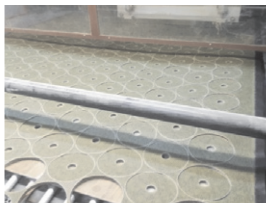
Fig. 2. View of the location designed for cutting disks out from glass meshes saturated with PF composition

The obtained composition of PE with 1 or 3 wt % addition of bentonites was applied to impregnate fiberglass meshes with varied basis weights: 195, 265 or 464 g/m 2 . The impregnation was performed using a coating line, presented in Fig. 1, with supersaturation speed of 5 m/min and the drying duct length of 12 m. The temperature of drying was 140 °C. From the obtained meshes the disks with outer and inner diameters of 229 and 23 mm, respectively, were cut. These disks, shown in Fig. 2, were applied during dynamic strength testing. The squares with a side of 250 mm were also cut and were subjected to additional crosslinking process at 160 °C for the period of 4 h.